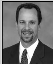
Kyle Kallander Commissioner